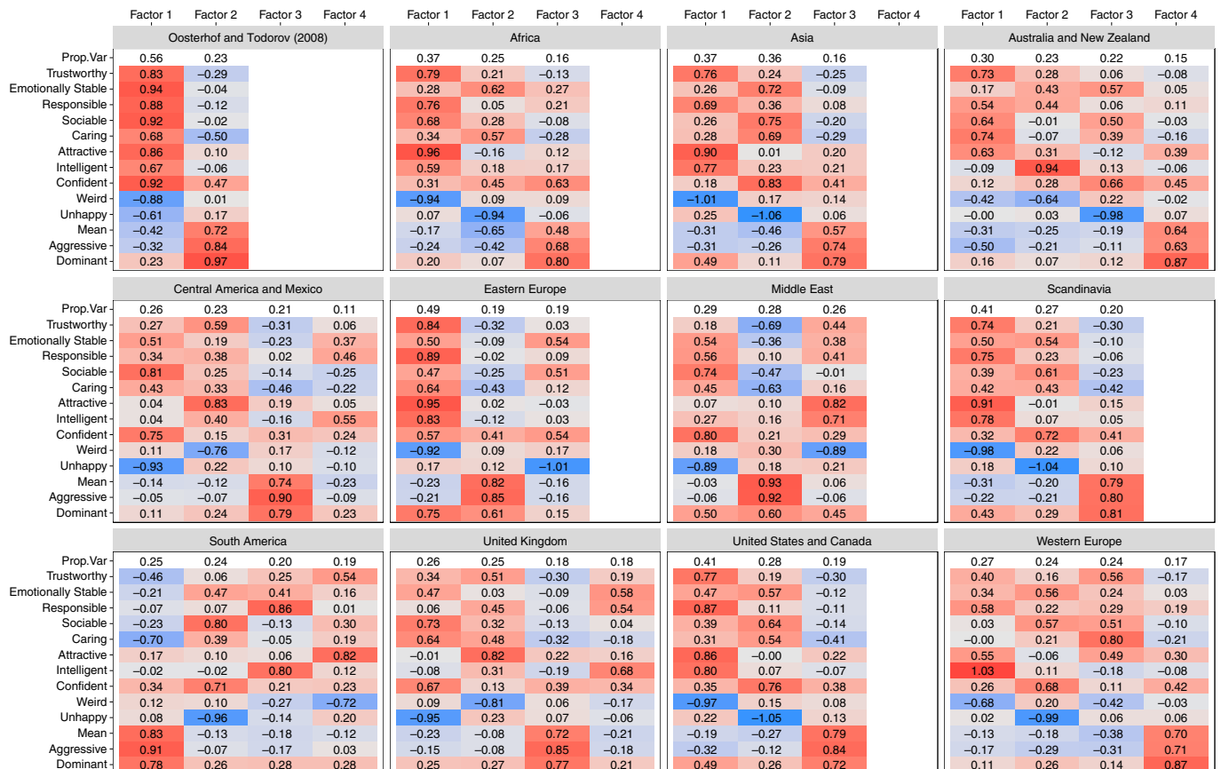
Fig. 2 | EFA loading matrices for each region. Positive loadings are shaded red and negative loadings are shaded blue. Darker colours correspond to stronger loadings. The proportion of variance explained by each factor is included at the top of each table.

Our study is one of several recent studies that have begun to utilize different statistical models and to explore more dynamic theories of trait ratings 21,29,30 by exploring how the structures of trait ratings vary systematically. This growing body of work catalogues variations in trait ratings by target demographic 21,29,31 , target status 32 , target age 33 , perceiver knowledge 34 and cultural factors 17,18 . Furthermore, this growing body of work proposes dynamic theories of person perception and more flexible statistical models for capturing them 21,29,30,35 .